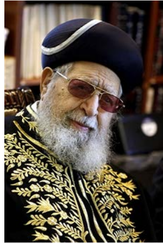
The late rabbi Ovadia Yosef, the most important Mizrahi religious figure of the last century.

To anyone convinced that Israel’s war with its neighbors will end in a reasonable compromise, such stubbornness must seem lamentable. If, however, one understands the conflict as a test of wills that will go on indefinitely, and in which Israelis are