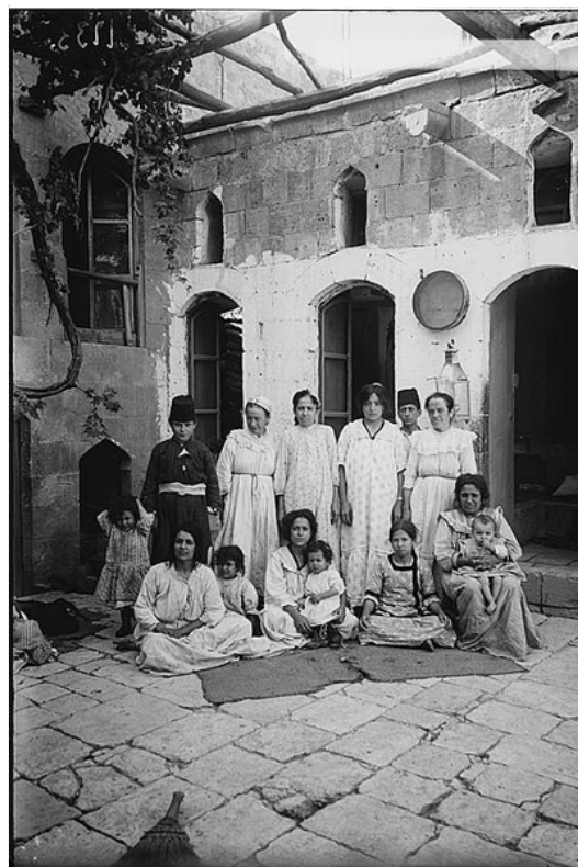
A poor Jewish family of Aleppo in the early 20th century.

In all, there were nearly a million Jews living throughout the Middle East only 70 years