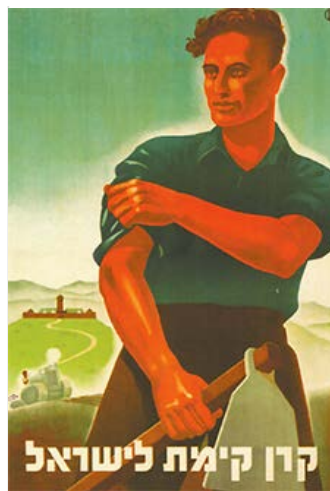
The European pioneer.