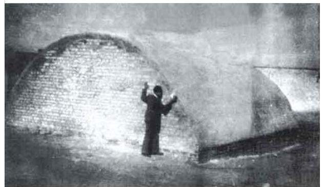
A mass grave of victims of the Farhud. 1946.