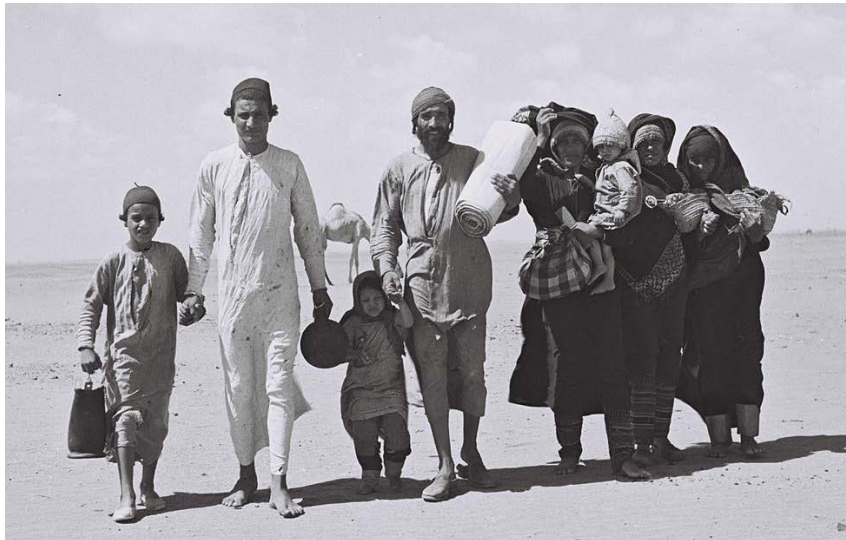
Yemenite Jews walking to Aden, the site of a transit camp, ahead of their emigration to Israel in 1949.

20 Comments | Print | E-mail | Kindle | Tweet 80