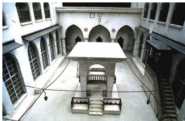
The courtyard of the Great Synagogue of Aleppo, as depicted in a detailed model. Beit Hatfutsot, Museum of the Jewish People, Tel Aviv.