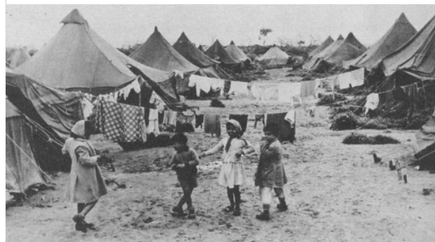
A transit camp (maabarah) for Mizrahi immigrant refugees in 1952.

Aesthetically, many of the videos are not especially different from what one sees on Arabic music channels elsewhere in the region. Most of the songs are about romantic love, of course, but in this genre it is wholly permissible to devote earnest love songs to